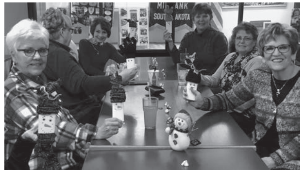
MARTA Members showing off their snowman projects

Our regular March meeting will be held on St. Patrick's Day, so why not have a St. Patty's Day Party? Wear green!