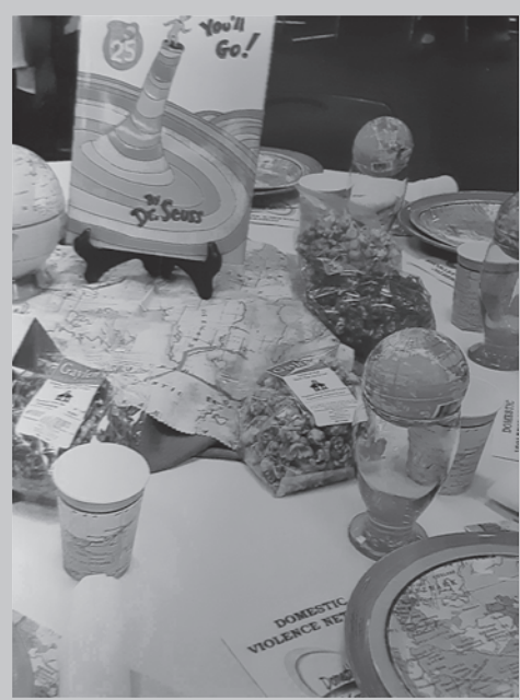
Table setting at the Tour of Tables event

The MARSP group held the Christmas party luncheon at Nicky's restaurant in Madison. Treasure Trivia and Bus Bingo were enjoyed, and everyone went home with extra cash and/or DQ coupons.