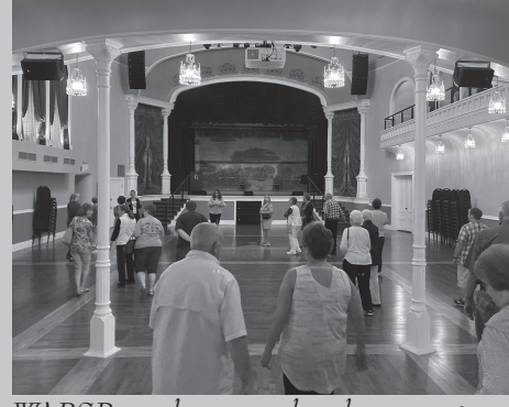
WARSP members marvel at the renovations of the Goss Opera House.