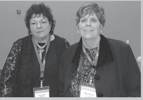
Sioux Falls Community Service award Silver