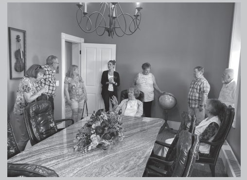
Members check out the conference room at the Goss Opera House.

We are now planning programs for our next year beginning with a potluck picnic and membership drive at Bramble Park Zoo.