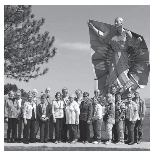
Pre-convention group toured Dignity, Akta Lakota Museum and SD Hall of Fame.