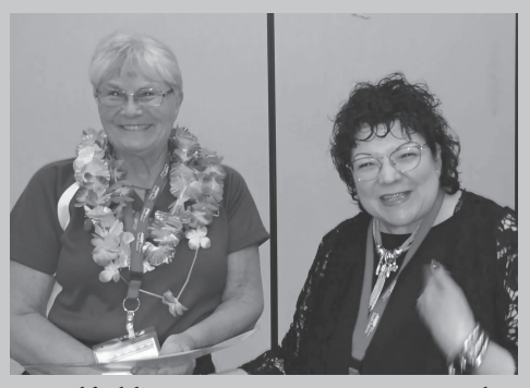
Redfield Community Service award Silver