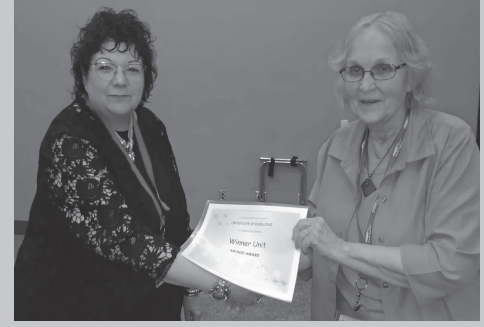
Winner Community Service award Bronze