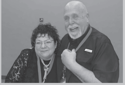
Watertown Community Service award Gold