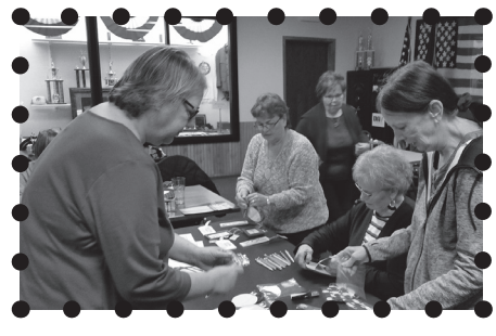
Members decorated Christmas ornaments for the annual Courthouse Festival of Trees.

The Milbank Area Retired Teachers Association (MARTA) continues with an active agenda.