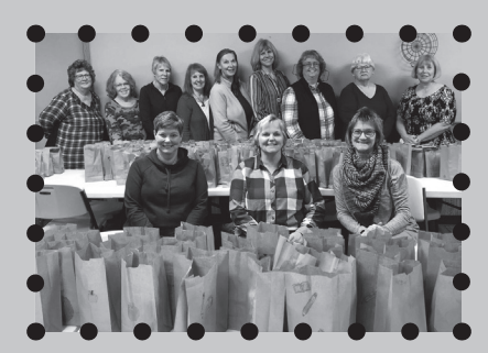
We filled 273 treat bags for American Education Week.

Sisseton Area Retired School Personnel Association have had a busy fall beginning their 2nd year of their State affiliation! We have increased to 25 members, meeting the 3rd Monday of each month. This fall already we have made new teacher gift bags for 23 new teachers between the Sisseton Schools and Tiopsa Zina. This month, in the picture below, we have just completed filling 273 treat bags for all employees of the Sisseton and Tiopsa Zina schools for American Education Week. We are also in the process of collecting donations of new and gently used outer wear for our students in need in our schools. The project is called WOW (Winter Outer Wear) for Kids involving all of our churches in collecting the donations.