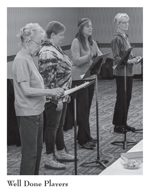
The Well Done Players from Rapid City entertained attendees with clever, well-written happenings in the 1960's.