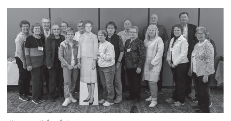
Country School Connections

The pre-convention tour was Tatanka Story of the Bison