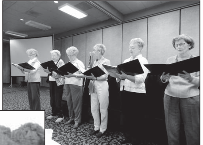
“The Three R’s by the Well-Done Players Theater Group”